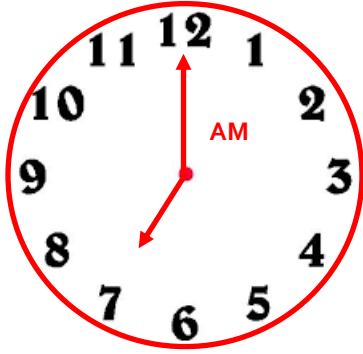
Polls open at 7 a.m.

Polls in Pennsylvania are open on Tuesday, 7 November 2017 from 7 a.m. to 8 p.m.